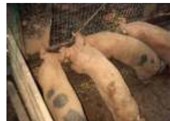
I remember the time I raised animals to support this ministry

continue to pray for the incarcerated, and the Church in the prisons. Like the true Church on the outside, true believers are constantly under attack from Satan. Budget cuts always seem to affect programs for the inmates as these cuts have affected their food and medical care. Many people could care less; let us pray we never become so self-righteous to be like that.