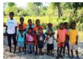
Some of the children in an orphanage in Haiti that Rehoboth Jail & Prison Ministry supports.

Overflow me with your loving Spirit so I can accomplish your love to those I find it impossible to love on my own.