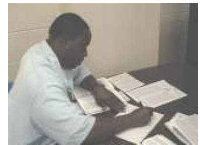
Just one of many inmate pen pals we have written in the past.

editing. I would send you the items to be edited as an attachment and when you are done you would send them back as an attachment. The main thing is having the time to do something if it might be needed in a hurry and the other editors were not available.