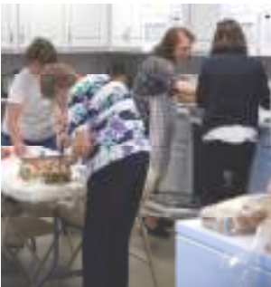
Ladies of LWCF preparing the meal