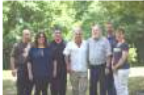
Ministry Board 2021